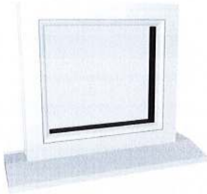
viewed from inside